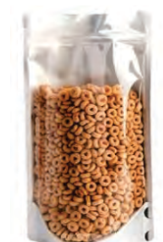
Clear/Foil Stand Up Pouches