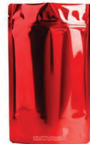
Plain Foil Stand Up Pouches

Packaging that won't tear or damage on the shelf, in transit or with customer handling.