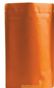
Matte and Satin Stand Up Pouches